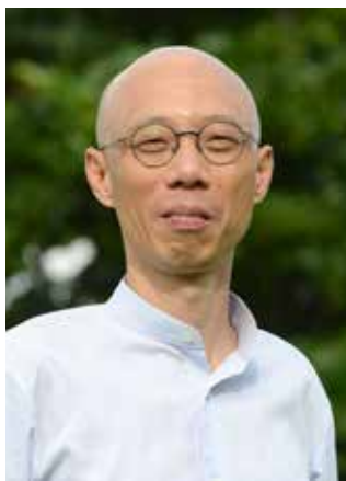
環境局局長 黃錦星