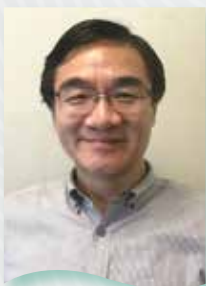
Dr Lau Kwok Keung 劉國強 博士

In a vibrant metropolis like Hong Kong, most people usually notice sound they felt annoyed. Through this competition, people are inspired to take note of representative soundscape, be it annoying or pleasant and the first sound map of Hong Kong is successfully generated for people to appreciate various soundscape at different locations.